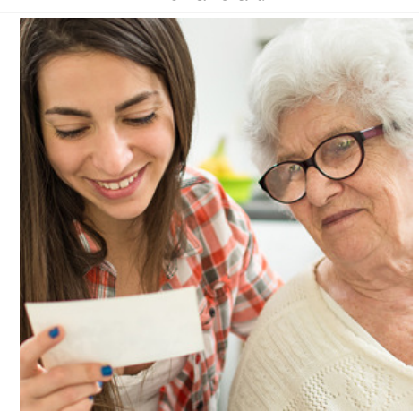
(n) A longing for a certain time in the past.