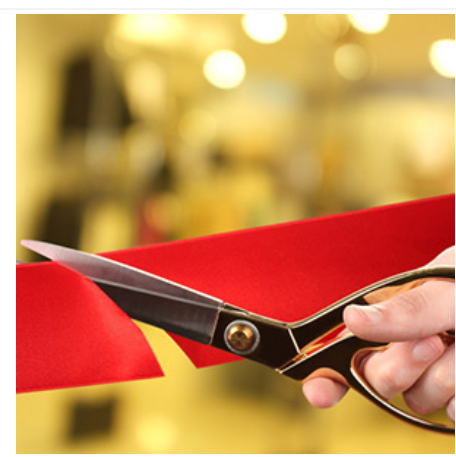
(v) 1. To break off.