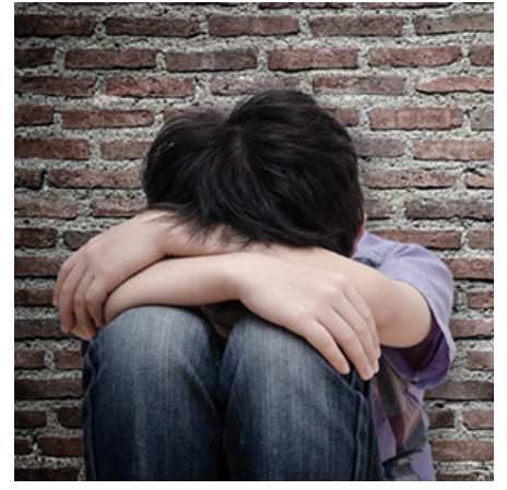
(v) To lose hope.

(n) A total lack of hope. (n) The place to which something or someone is going.