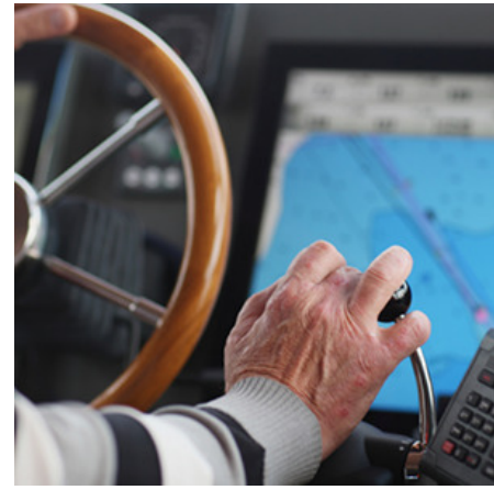
(v) To calculate or direct the movement of a ship or aircraft.