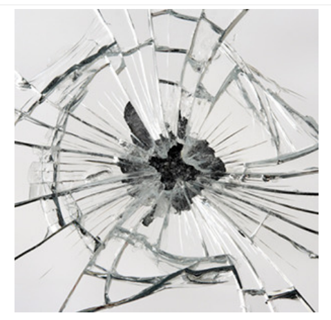
(n) A crack or break, as in metal or bone.