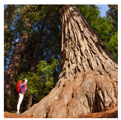
(adj) 1. Great in size or extent.