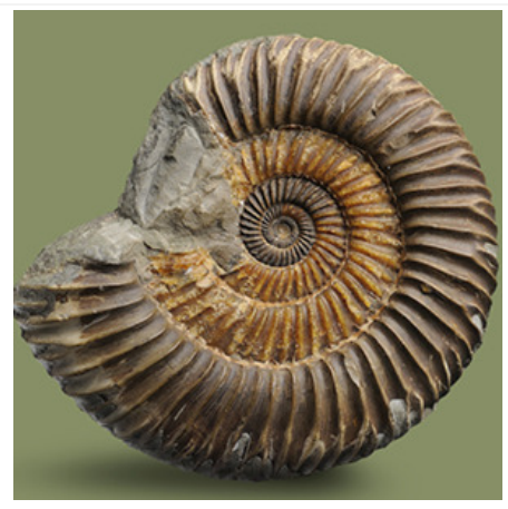
(v) 1. To make rigid with terror; to terrify.

2. To change into a stonelike substance.