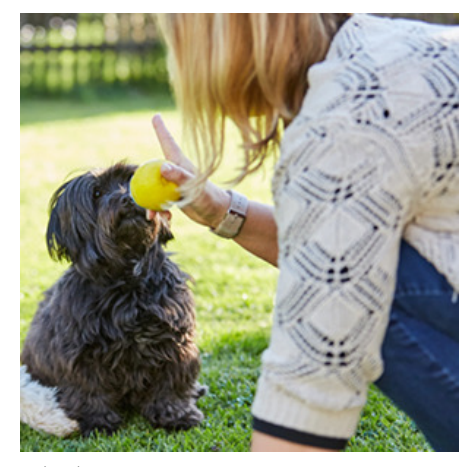
(adj) Doing what one is asked or told.