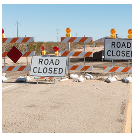
(n) Something that prevents one from moving forward.