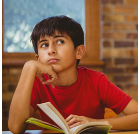
(v) To draw one's thoughts or attention away from the subject at hand.